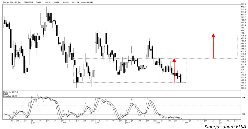
Kinerja saham ELSA

Danareksa research report are also available at Reuters Multex and First Call Direct and Bloomberg